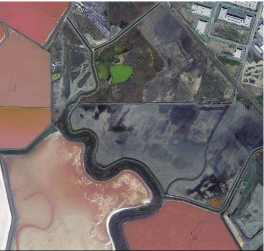
Whistling Wings and Pintail properties would provide rare transition habitat between tidal marsh and uplands.