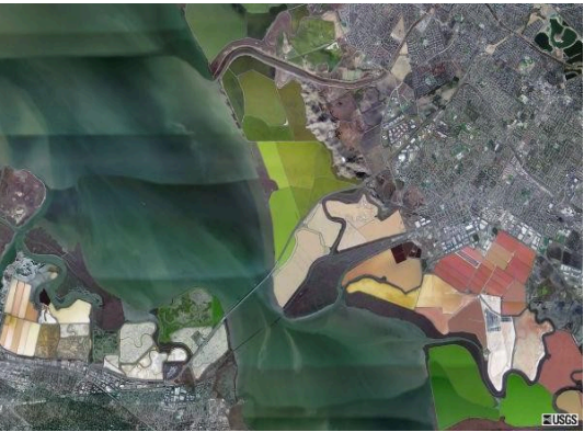
Salt ponds near Newark, CA. Most of the large irregularly shaped ponds in green red, brown and tan are lands now owned by the public in fee title. These lands are still in salt production.