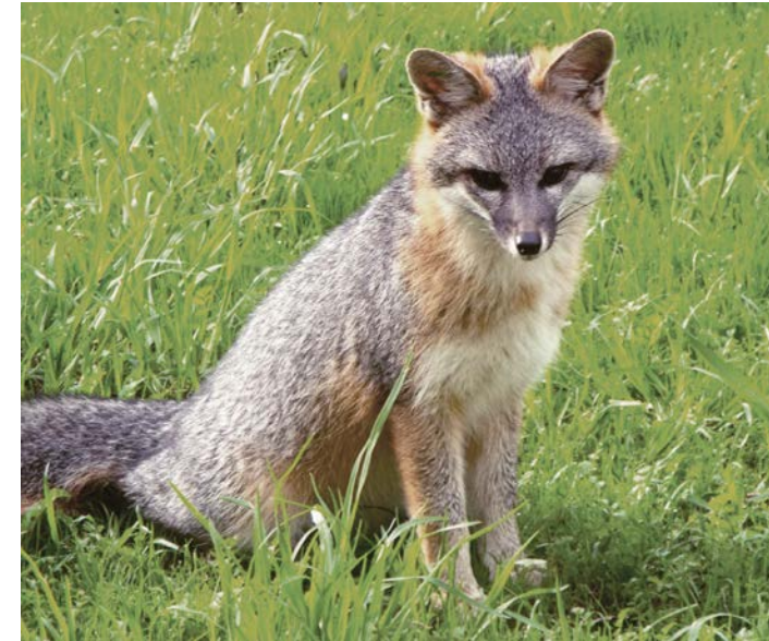
Gray fox at Mayhews Landing