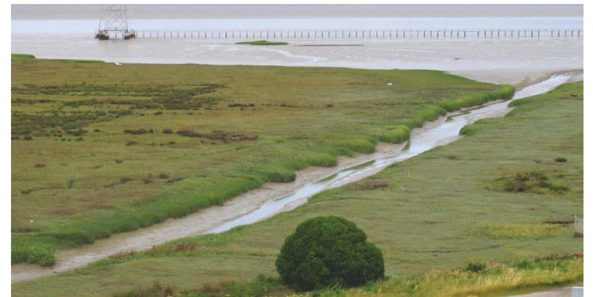
Greco Island-Westpoint Slough at Pond R4

Eileen McLaughlin wildlifestewards@aol.com