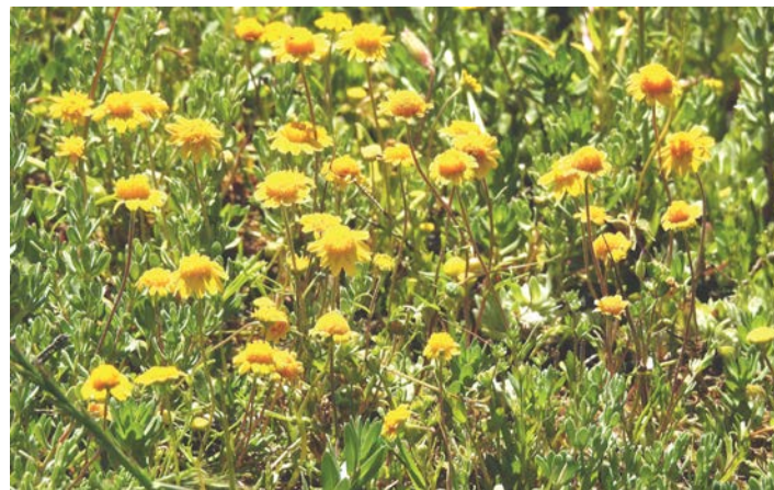
Endangered Contra Costa Goldfields, Warm Springs Unit