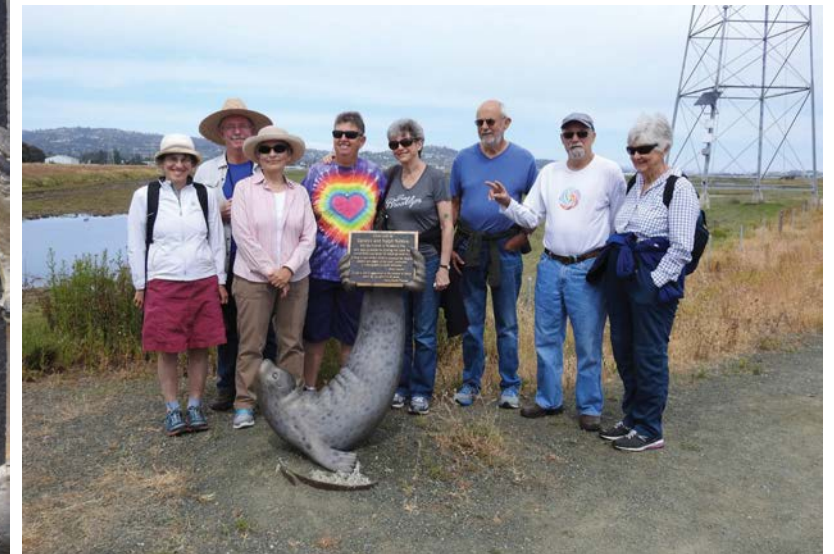
Friends of Redwood City at Bair Island trailhead and dedication plaque